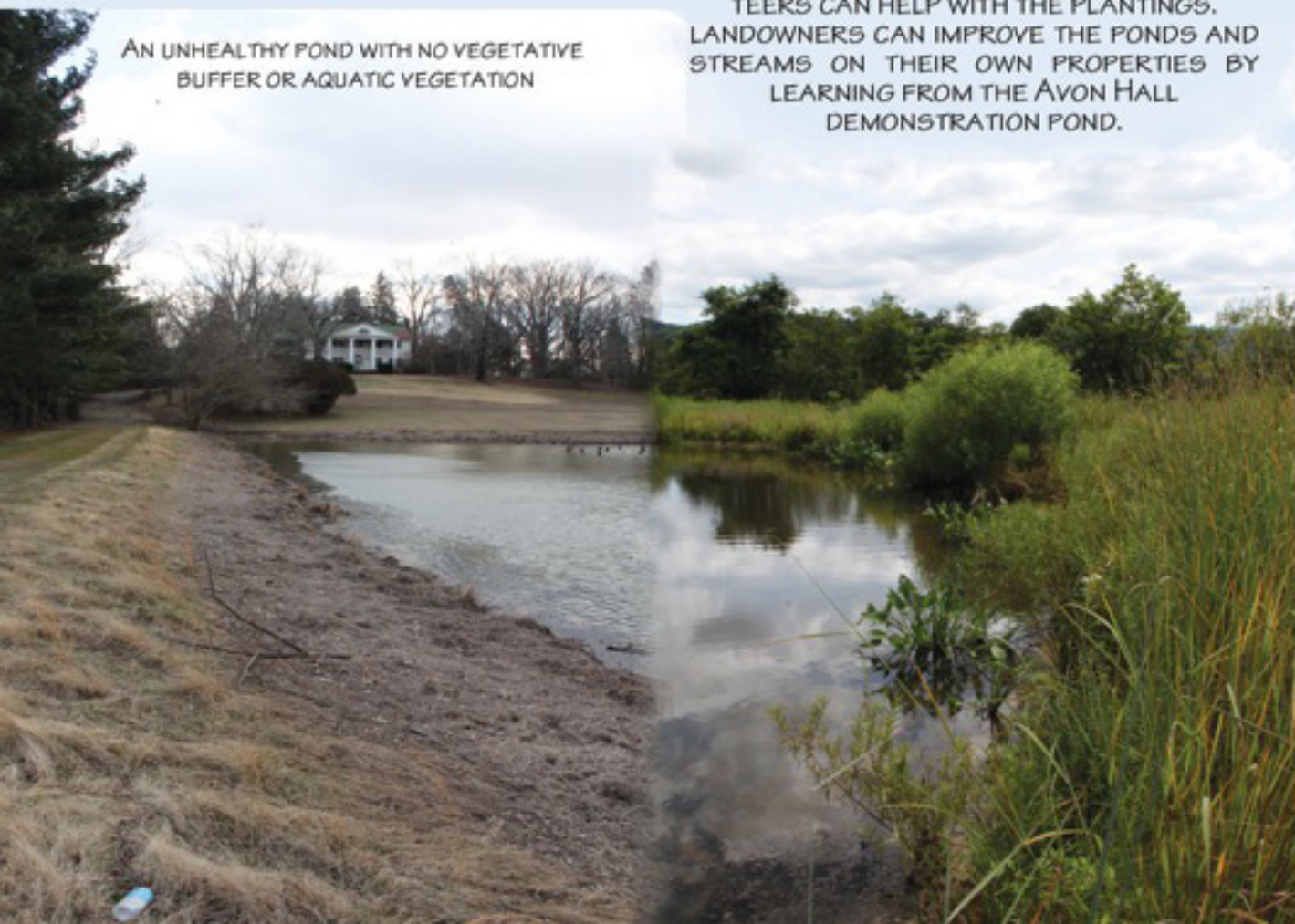
AN UNHEALTHY POND WITH NO VEGETATIVE BUFFER OR AQUATIC VEGETATION

MANY LANDOWNERS VISIT THE TOWN OF WASHINGTON AND CAN OBSERVE THIS POND IN TRANSITION. STUDENT AND CITIZEN VOLUNTEERS CAN HELP WITH THE PLANTINGS. LANDOWNERS CAN IMPROVE THE PONDS AND STREAMS ON THEIR OWN PROPERTIES BY LEARNING FROM THE AVON HALL DEMONSTRATION POND.