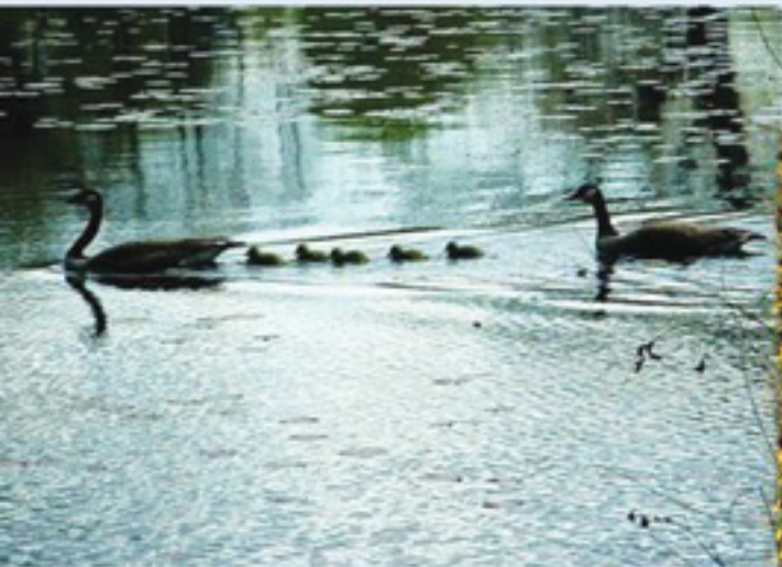
MANY GEESE IN THE POND BEFORE THE TRANSITION TO A HEALTHY POND